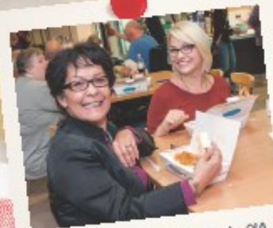
Have fun and raise money for the SIA